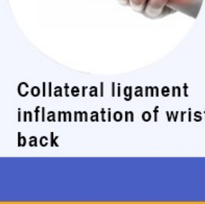
Collateral ligament inflammation of wrist back