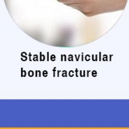
Stable navicular bone fracture