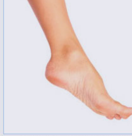
People who stay in bed for a long time, prevent foot drop